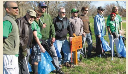
Whole Earth Provision Company AAS Group

One sponsor that stood out in 2009 is Whole Earth Provision Company . They performed WAY beyond the call of duty. While we don't recommend that everyone try this, they removed among other things, two 50-gallon drums, numerous shopping carts, a slew of tires, and miscellaneous items, some of which now reside at the White Rock Lake Museum housed at the FTLOTL office. A member for almost two years, Whole Earth Provision Company has made their mark on our clean-up program, making a considerable dent in our effort to keep the pervasive lake litter at bay.